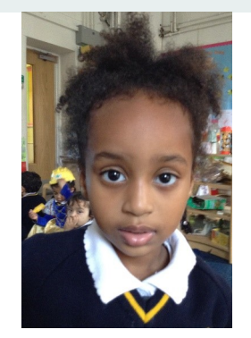
Selena YN "We read the Three Little Pigs and built houses from sand."

Book Fair- Week beginning 22<sup>nd</sup> November