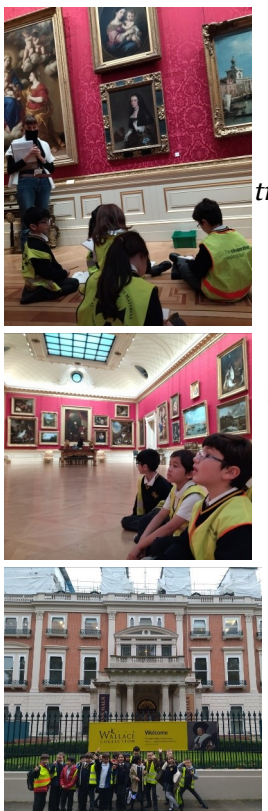
Gaby Y3 "We went on a trip to an Art Museum called The Wallace Collection. We visited different rooms

Gill Putterill and the St Cuthbert Teaching Team