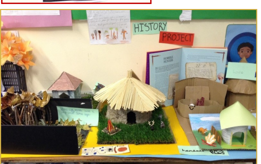
Year 1's fantastic tree