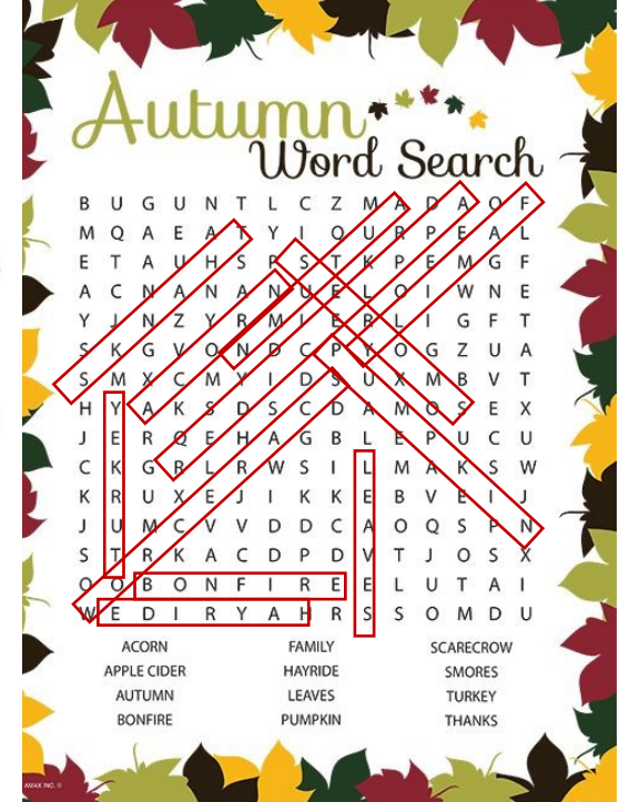
Answer to last week's puzzle

ere will be exciting prizes, for the right answer to this week's puzzle handed in on Thursday. Please write your name and answer on a separate piece of paper. Good luck!