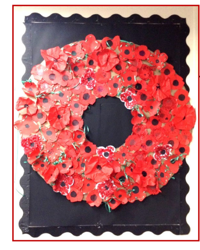
Year 6's great display of poppies.