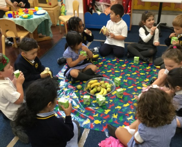
First Day Back for some of our reception children!