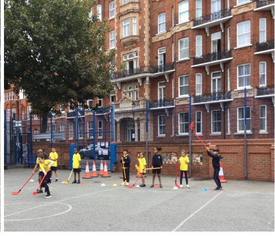
We have extra PE lessons in our weekly timetables! Our portacabin has gone, but we have a theatre instead!