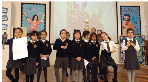
Year 3 shared their knowledge of the human skeleton in assembly.