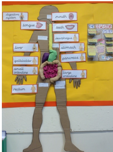
Year 4's great display of the human digestive system.