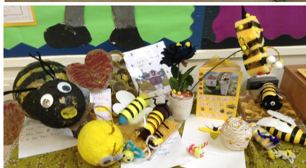
Collection of bees from Nursery and Reception classes.