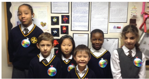
Well done to our Music Maestros from classes Y1 to Y6!