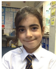
Serena Y3 "In English we have been playing a game called comma castle to help us with our punctuations."