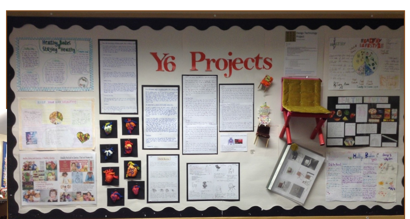
Amazing display of Year 6's Design Technology project and Healthy Body project.