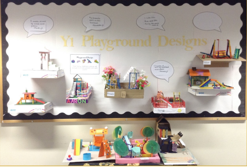
Beautiful display of Year 1's Playground Designs.