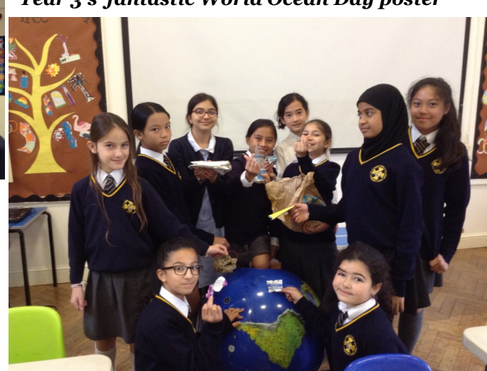
Our girls' football team collected plastic rubbish to celebrate World Ocean Day last week.