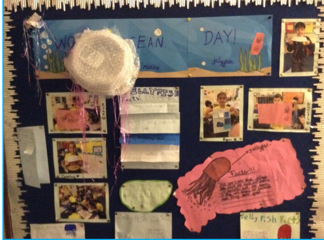
Year 3's fantastic World Ocean Day poster