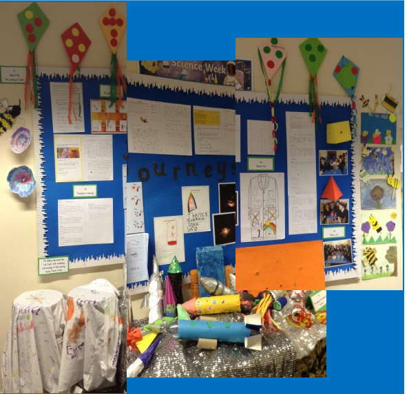
Our fantastic 'Journeys' display. A collection of projects and art works from each class created for Science week.

For more information speak to our receptionists.