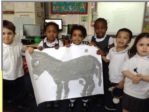
Nursery children telling the story of Jesus and the little donkey.