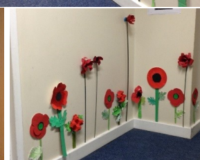
Our Remembrance Walls decorated with poppies made by our children in each class.