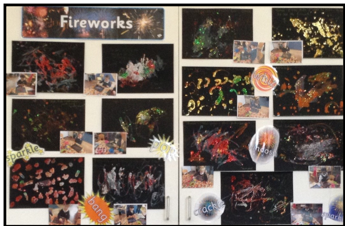
Nursery's fantastic display of firework paintings done by the children.