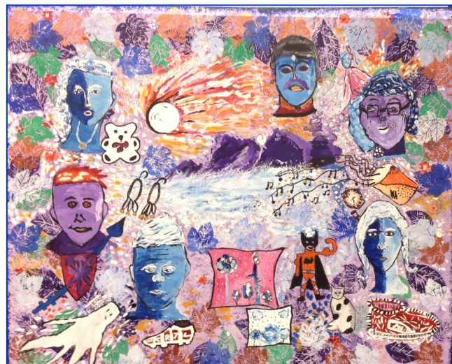
Year Y4's painting for our 'Tales from our community' project.