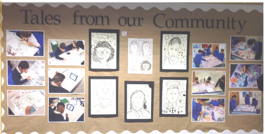
Year 4's fantastic display of 'Tales from our Community' art works.