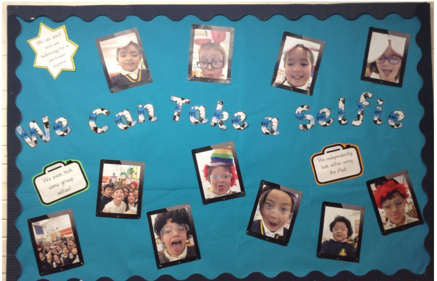
Reception's fun display of pictures (selfies) taken by the children.

Tallulah Y3, "In Maths we have been learning the grid method to solve multiplication problems."