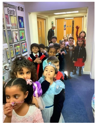
Year 1 & 2 all dressed up astheir favourite book characters.