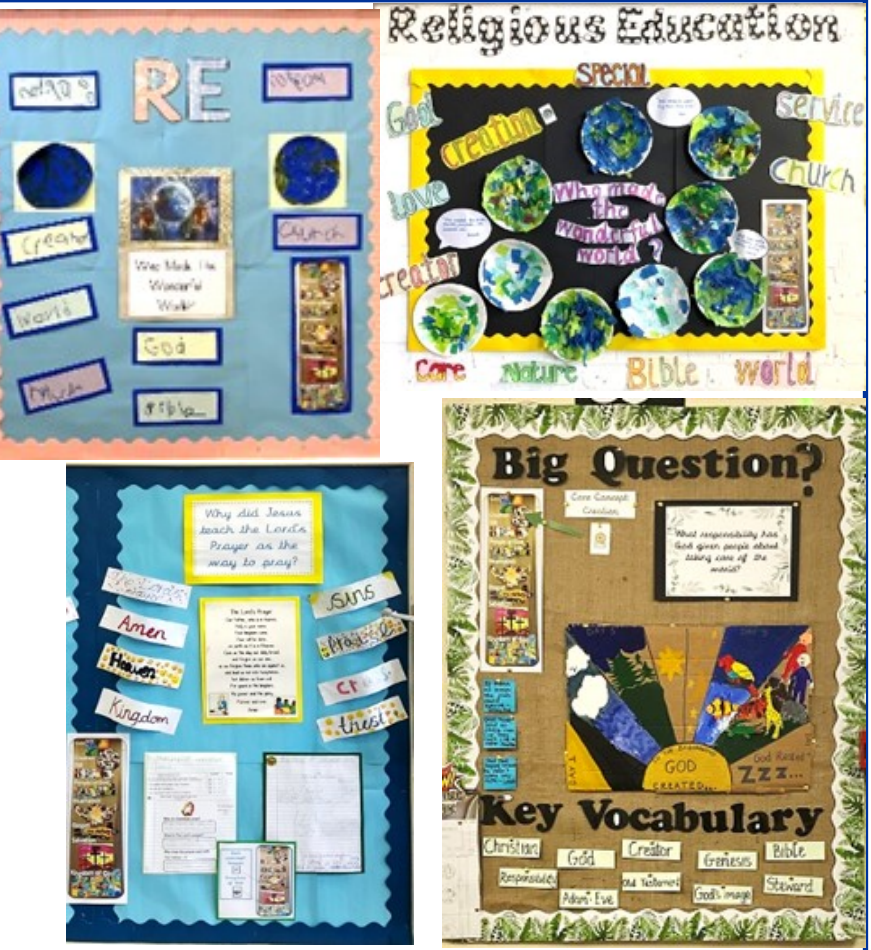
Beautiful displays of RE learning from different classes.