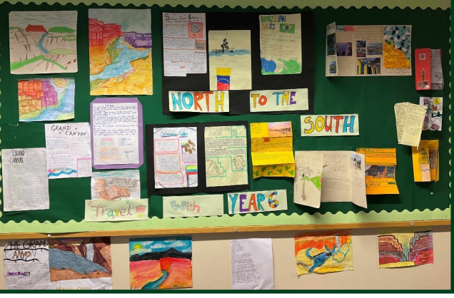
Year 6's fantastic travel writings and posters from around the world.