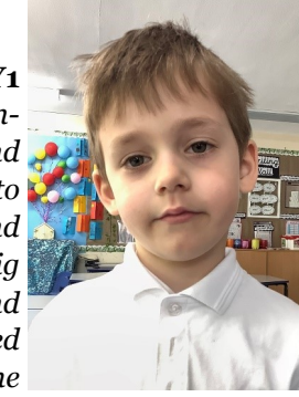
meter rulers and wrote down the measurements."

"In Maths we are learning about lengths and heights. We went out to the small playground and measured the big wooden toys, trees and some plants. We used