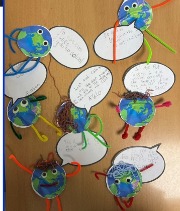
A collection of Earthmen with important messages on how to keep our planet safe from pollution.