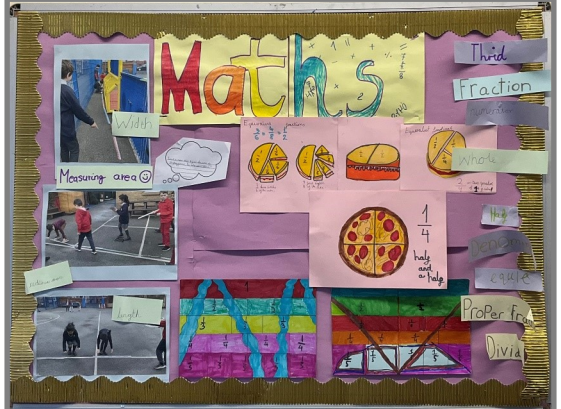
Year 4's fantastic Maths display all about fractions.