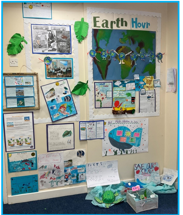
A beautiful display of our Earth Hour posters and projects.