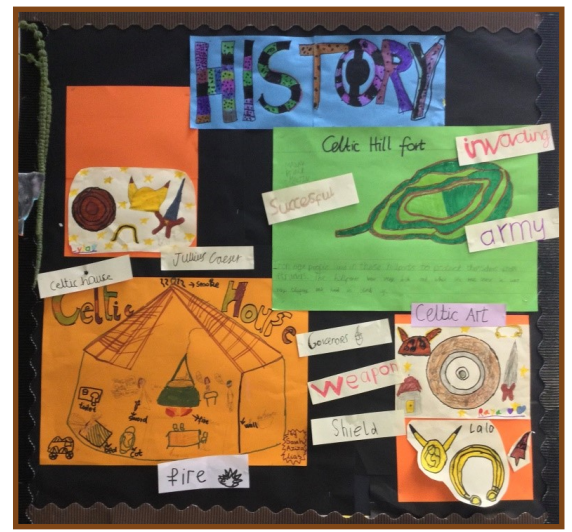
Year 3's amazing history display about the Celtic houses.