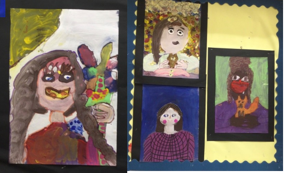
Great self portraits from Year 3.