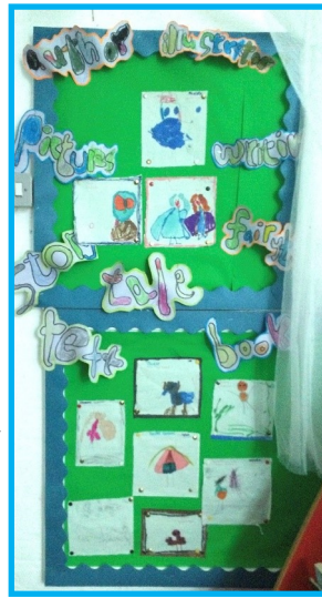
A beautiful collection of book cover designs from Reception class.

Ahmad Y1 "I wrote my words with out any help."