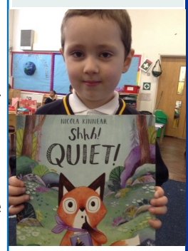
Mason YN "We read a book called Shhh! Quiet! It's about a fox with some very noisy friends."