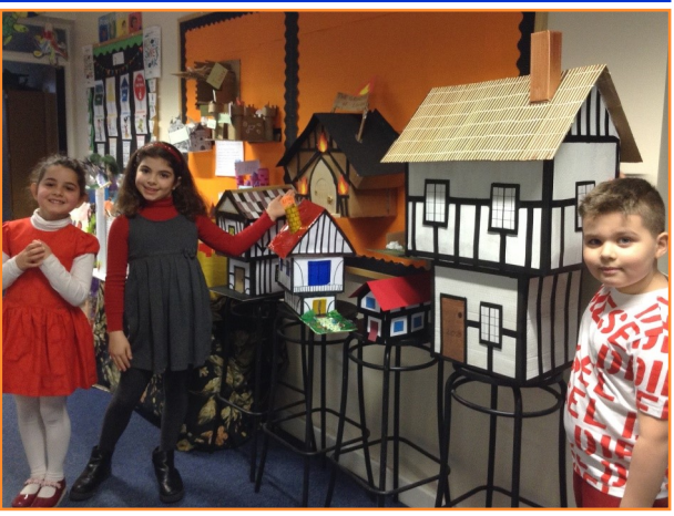
Year 2 children proudly showing their fantastic London houses from the Great London Fire.