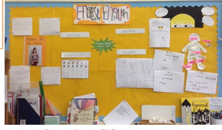
Year 2 's fantastic English display of the story of Rapunzel.