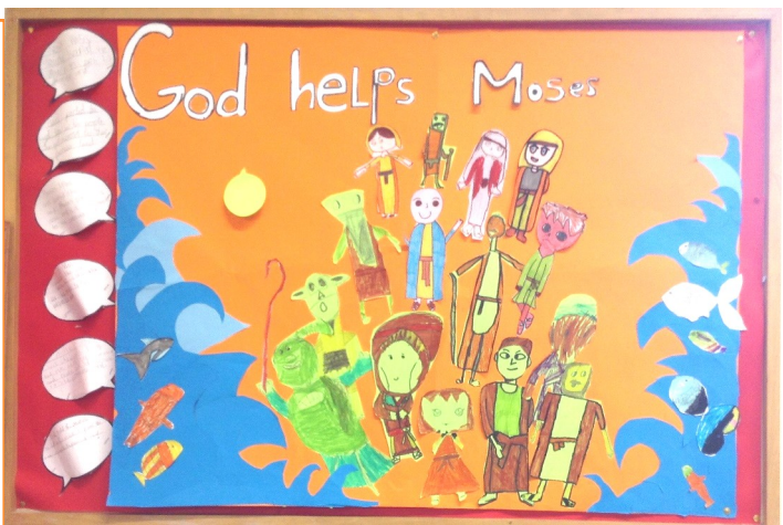
Beautiful Y4 RE display about the story of Moses.

https://www.nspcc.org.uk/keeping -children-safe/online-safety/