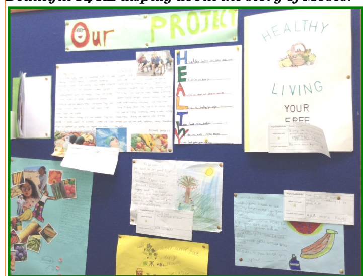
Year 3's great display of their project on healthy eating and living.