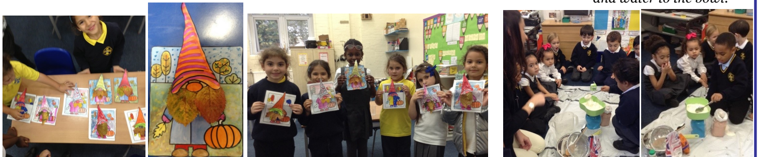
Children in Art Club made lovely Autumn Gnomes.

Kylo YR "We measured flour to make bread we also added oil, salt, yeast and water to the bowl."