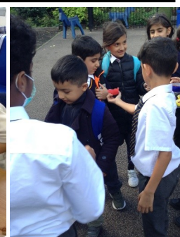
Our School Council made cupcakes and gave to their school mates.