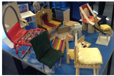
Year 6's amazing collection of chairs.