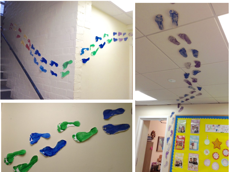
We have these lovely reminders of our 'Walk to School Week', all around the corridors.