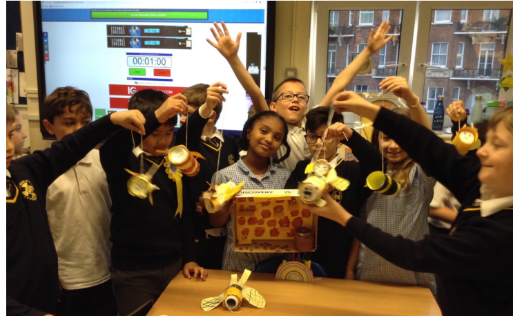
Year 3 children celebrating International Bee Day with their own fantastic bees and a beehive.