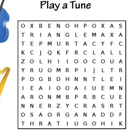
ACCORDION HARMONICA HARP MARIMBA CLARINET ORGAN PIANO RECORDER SAXOPHONE