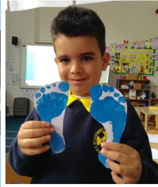
Younes YR "We made foot prints in our class. We are all walking to school next week. Because cars are not good for the environment."