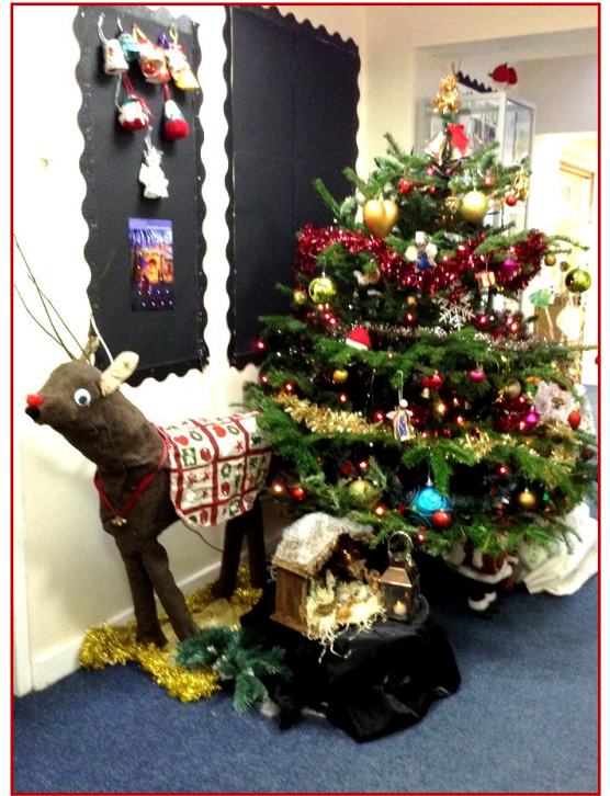
Our fabulous Christmas tree and our nativity scene