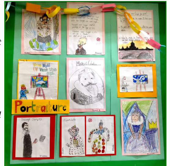
Year 3's fantast display of portraits of famous people.

continents, countries, oceans and rivers. We also learnt about OS symbol keys."