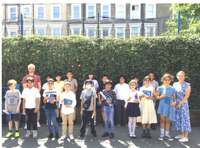
Year 6, our school leavers, in their last photo call.