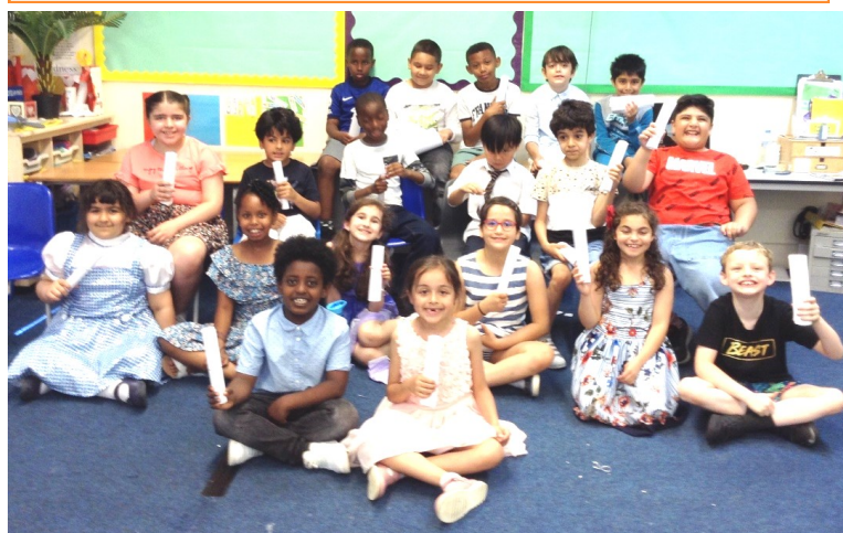
Reception, Year 1, Year 3, Year 4 and Year 5 graduation photos.