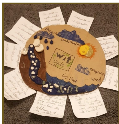
Serena, Y4 has made an incredibly creative water cycle project! Well done Serena!