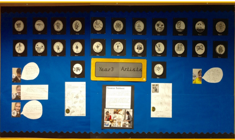
Year 3's incredible clay art display in our corridor.