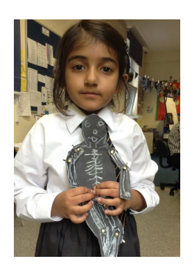
Hareem Y3, "We firstly drew the bone on black paper with white chalk. Then we cut out the bone shape and put it together to make a human skeleton."