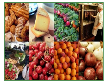
Earls Court Farmers' Market open on Sundays at our St Cuthbert's with St Matthias School.