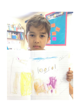
Sobhan Y1 "We went to our play ground and took some pictures. Then we wrote about the trees. How old and how tall they are. Then we drew and labelled them."