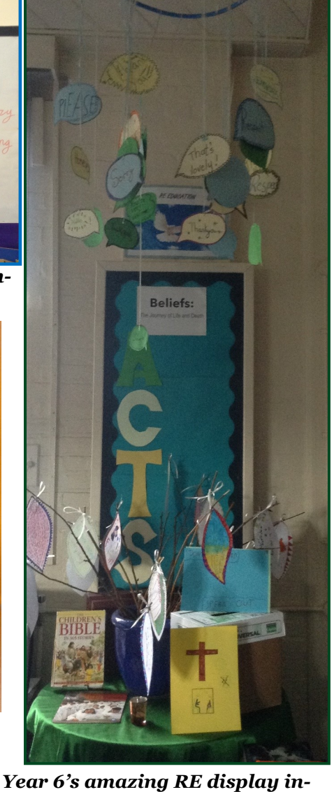
Year 6's amazing RE display including a worry box for children to post in their concerns and worries.